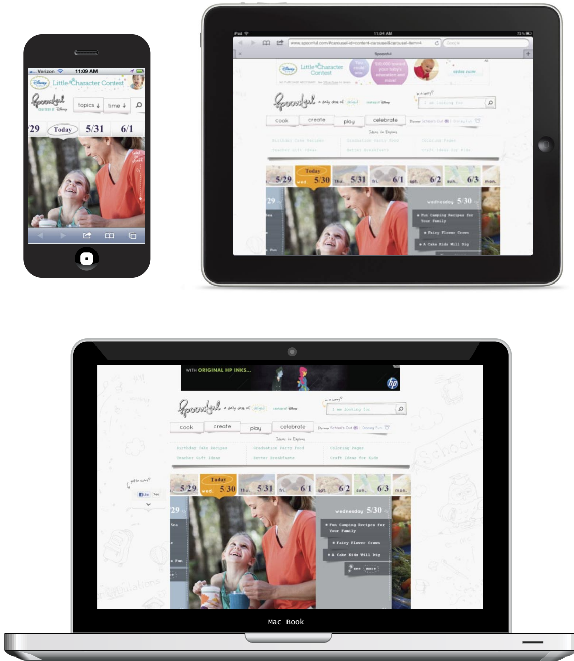
Figure 1 Responsive Sites Adapt To The Size And Orientation Of The Screen (Cont.)